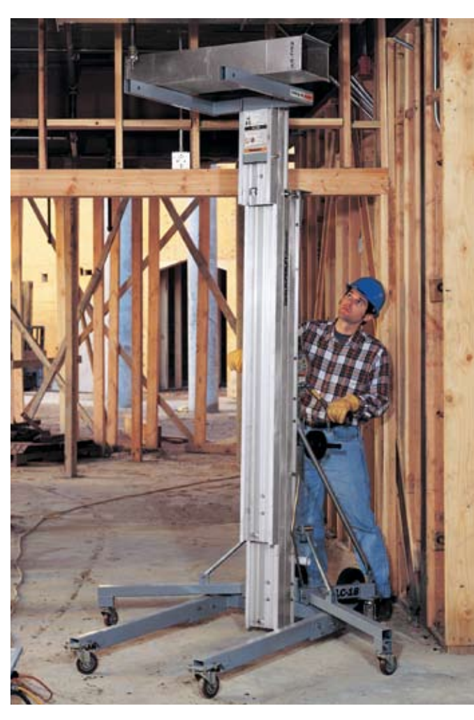
The captive stabilizer with patented "locking system" provides additional lateral support for heavy loads (standard on SLC<sup>T-18</sup> and SLC<sup>T-24</sup>).

SUPERLIFT CONTRACTOR® MODELS AVAILABLE SLC<sup>--</sup>12 | SLC<sup>--</sup>-18 | SLC<sup>--</sup>-24