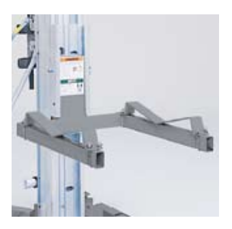
PIPE CRADLE helps hold odd-shaped items in place for easy lifting.