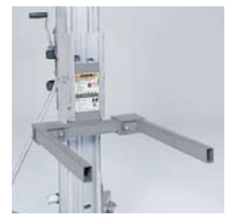
ADJUSTABLE FORKS widen from 11 to 30 in (28 to 76 cm) to accommodate diverse loads.