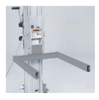
STANDARD FORKS accommodate various loads for versatile lifting. Get an additional 20 in (51 cm) of lift by turning over and re-pinning the forks.

A variety of load handling accessories make this unit extremely versatile.