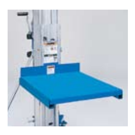
LOAD PLATFORM fits over the forks to handle odd-sized or heavy objects no tools required for installation.