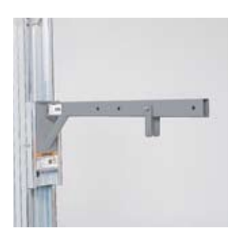
BOOM OPTION transforms your lift into a mobile, vertical crane or hoist to position tooling fixtures, circuit breakers, engines and more.