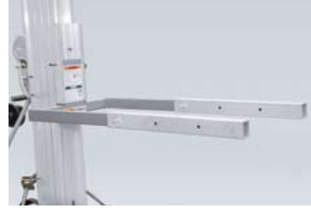
FORK EXTENSIONS insert onto standard forks for an additional 25 in (64 cm) of length.