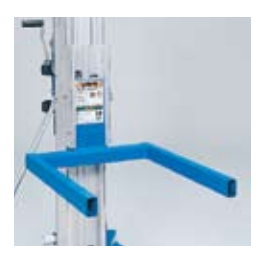
STANDARD FORKS accommodate a variety of general loads. Get an additional 20 in (51 cm) of lift by turning over and re-pinning the forks.

Interchangeable load handling attachments handle a large variety of workloads, so you can design your lift to meet your needs.