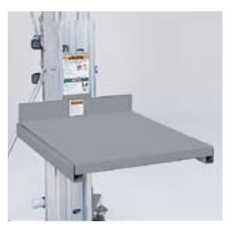
LOAD PLATFORM fits over the forks to handle odd-sized or heavy objects — no tools required for installation.