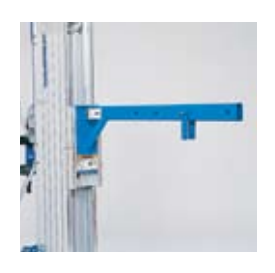
BOOM option transforms your lift into a mobile, vertical crane or hoist to position tooling fixtures, circuit breakers, engines and more.